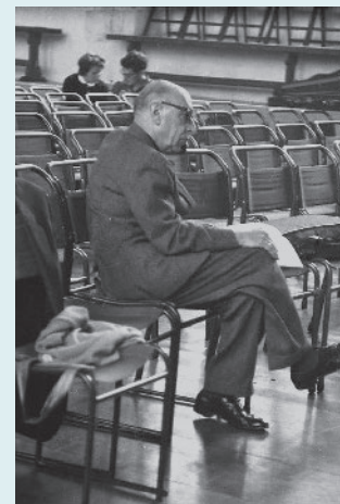
Igor Stravinsky listening to a rehearsal in the Great Hall, 1957.