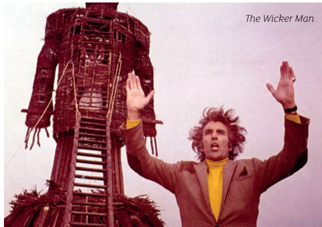
The Wicker Man

This unforgettable film has become rooted in our cinematic culture sending chills through cinema audiences in their millions. With music from Bach's Goldberg Variations , and Howard Shore's original score, the soundtrack is a vital as the iconic scenes that earned The Silence of the Lambs a place in film history.